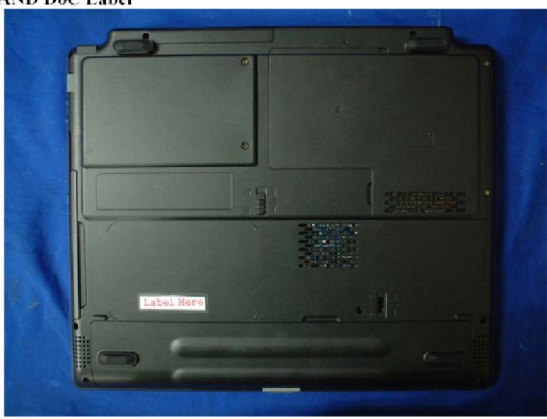
The FCC ID and DoC Label will be placed on the equipment as shown in the photograph below.