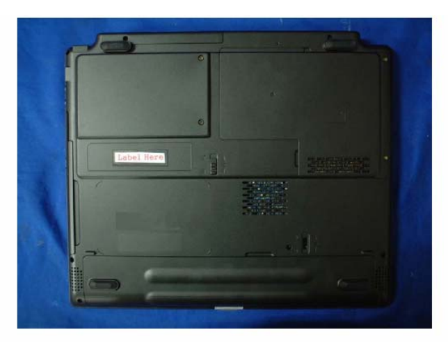
The FCC ID and DoC Label will be placed on the equipment as shown in the photograph below.

The Bluetooth portion is optional as given in a) above and has been Certified already under FCC ID: MSQBT183. This label will be placed onto the EUT in a separate location. See the following: