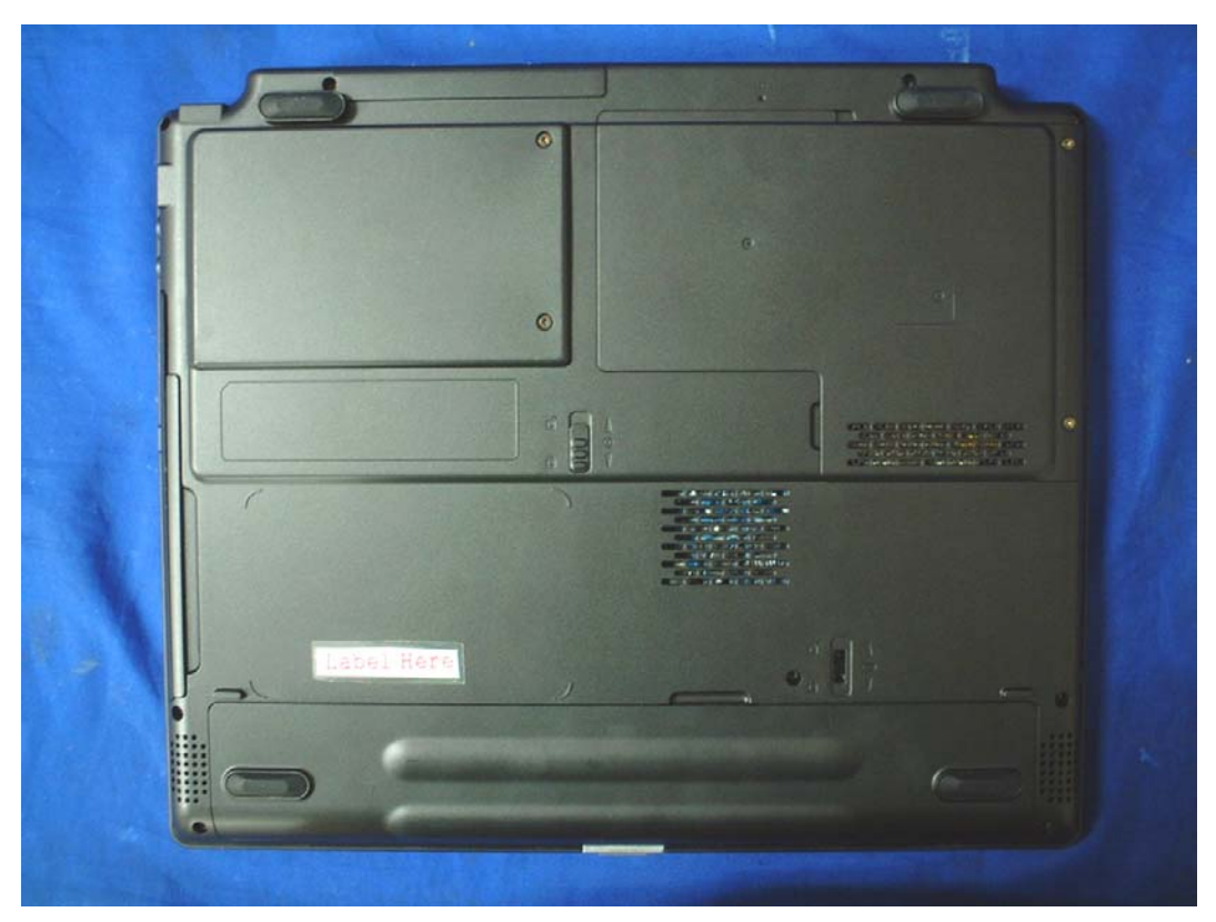
The FCC ID and DoC Label will be placed on the equipment as shown in the photograph below.