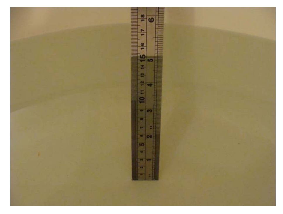
Depth of the liquid in the phantom-Zoom In (2.4GHz)