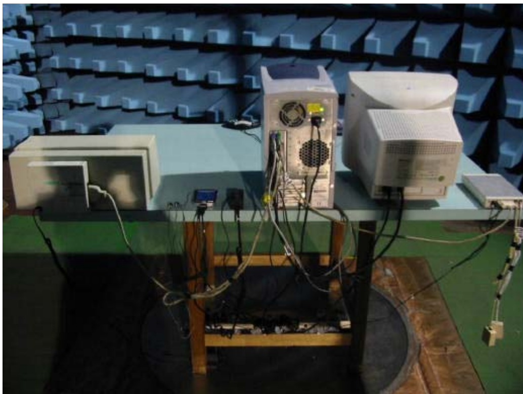
Rear View of the Test Configuration