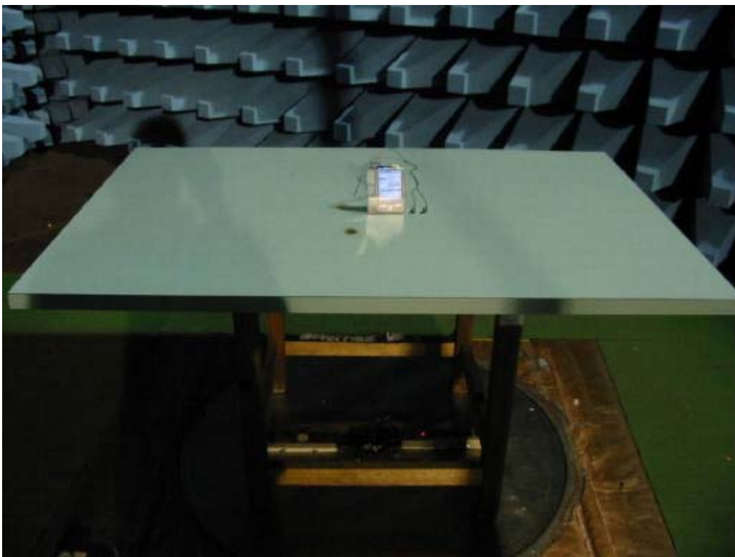
Front View of the Test Configuration of Y-axis