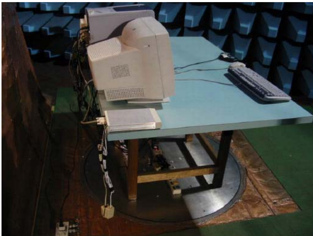
Side View of the Test Configuration