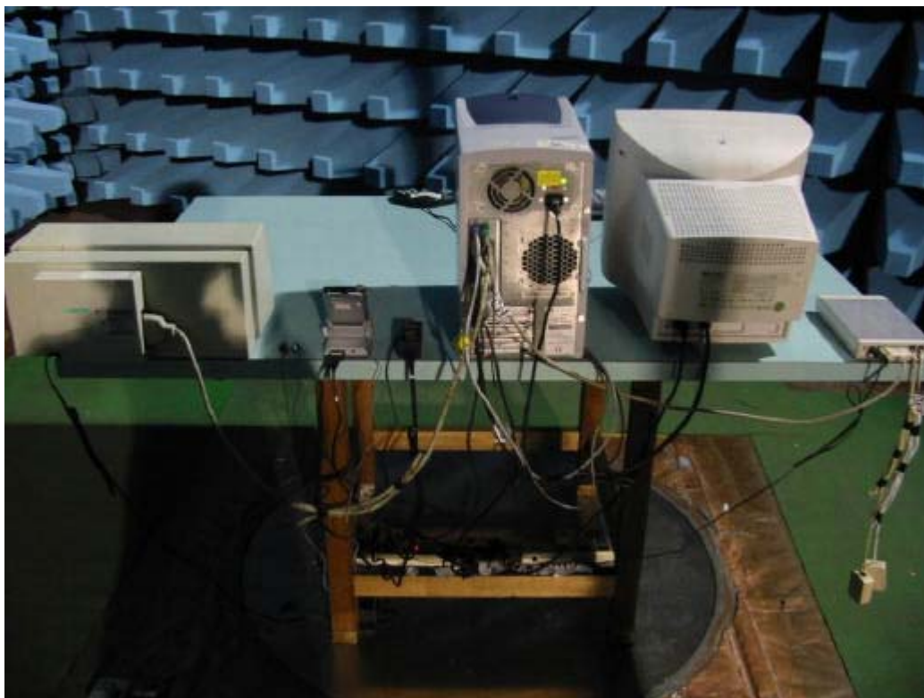
Rear View of the Test Configuration