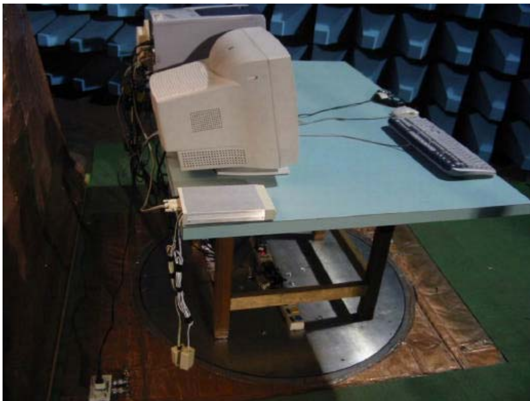
Side View of the Test Configuration