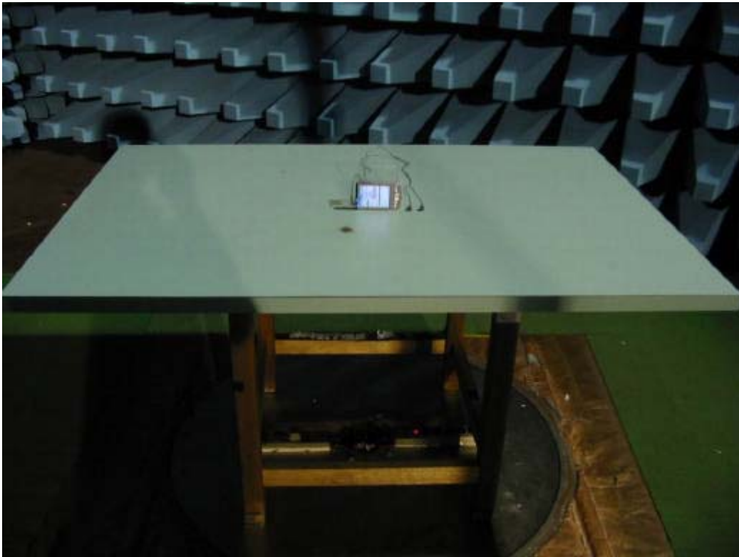
Front View of the Test Configuration of Z-axis