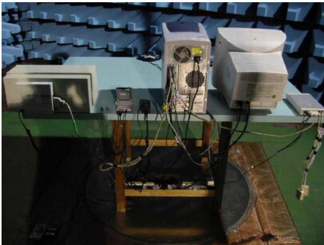
Rear View of the Test Configuration