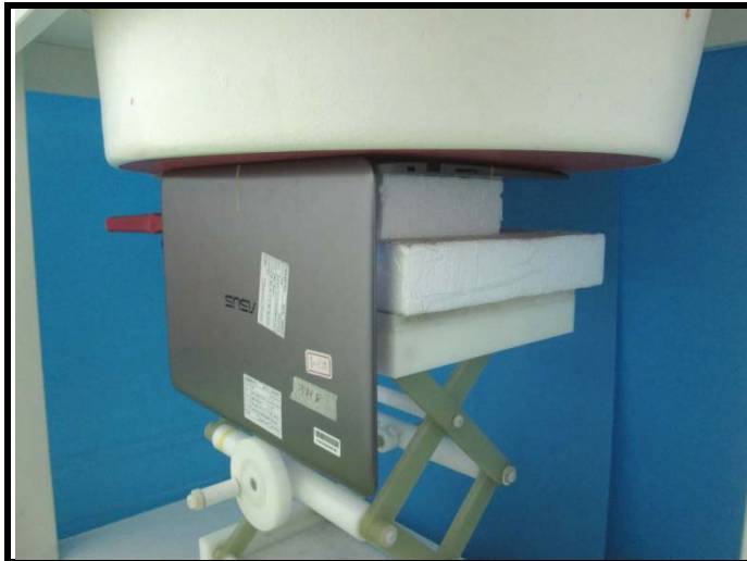
Bottom of EUT with 0 cm Gap