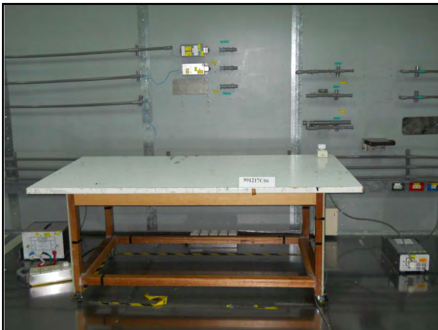
Conducted Emission Test