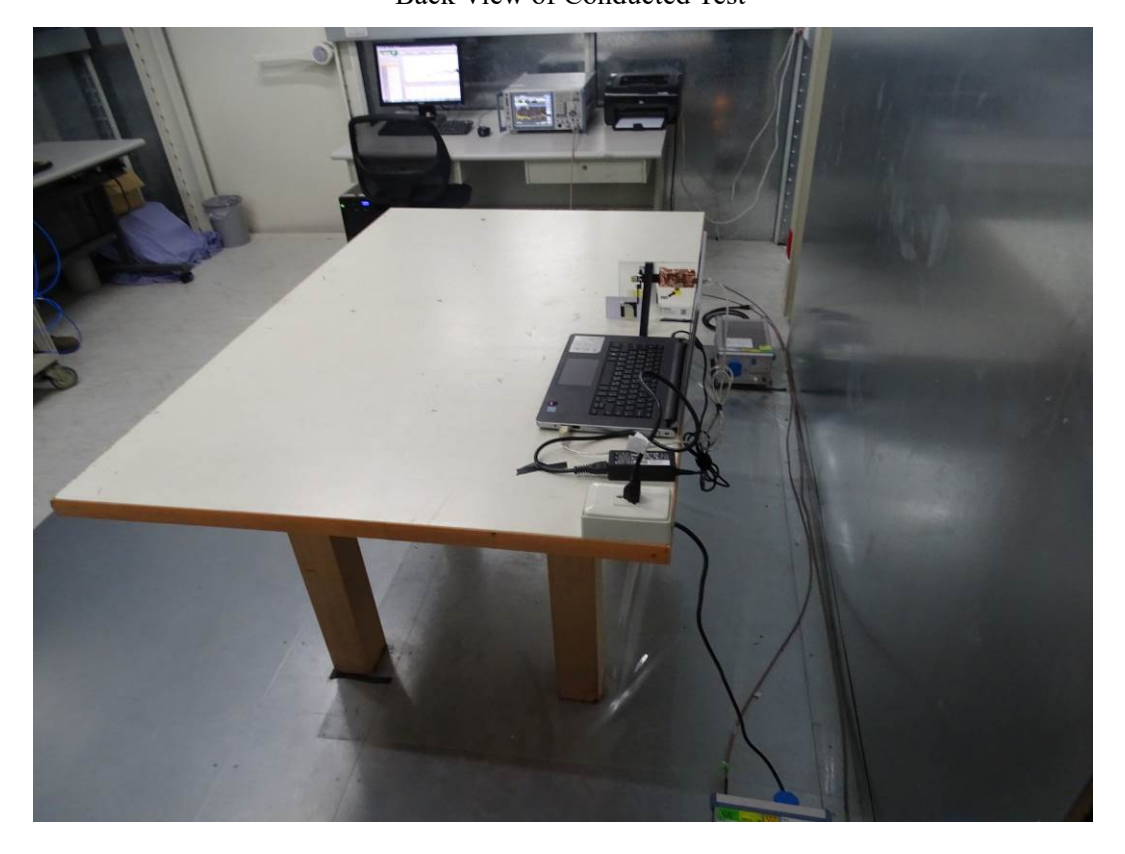
Page : 1 of 2