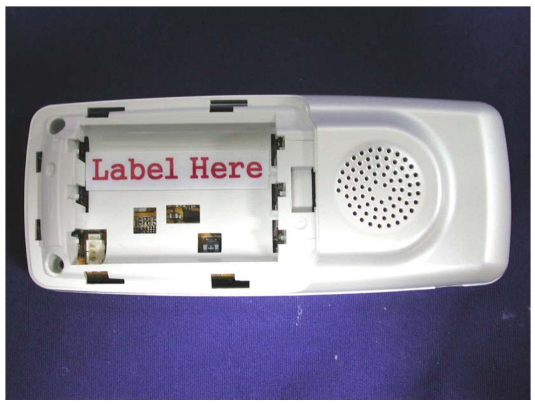
The FCC ID and DoC Label will be placed on the equipment as shown in the photograph below.