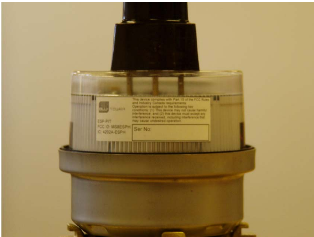
Figure 2: Label Location