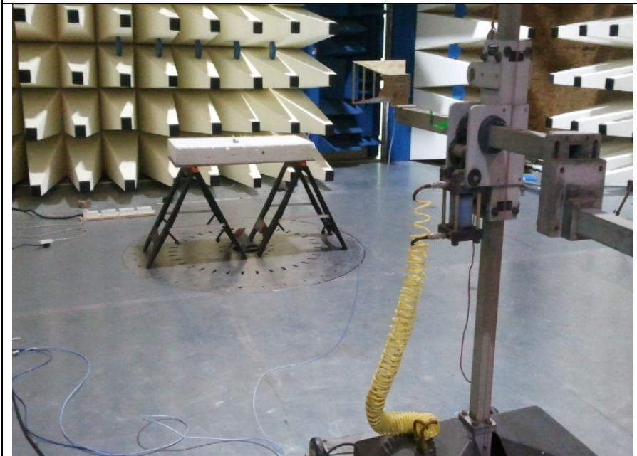
Fig 2 Test setup