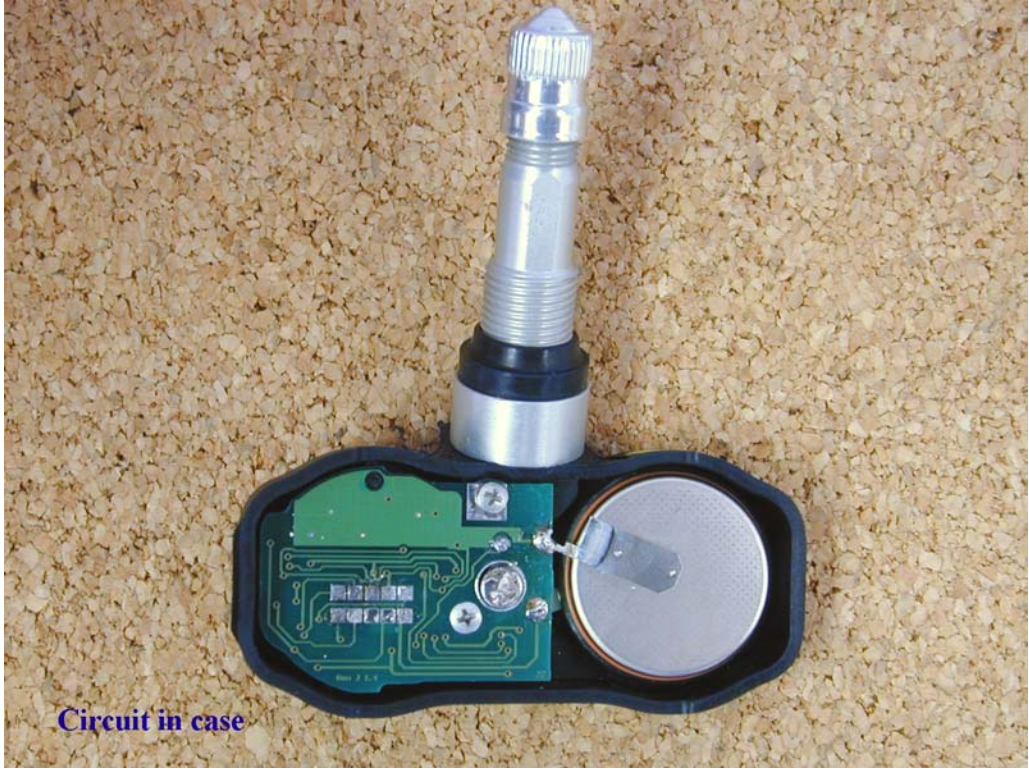
Circuit in case