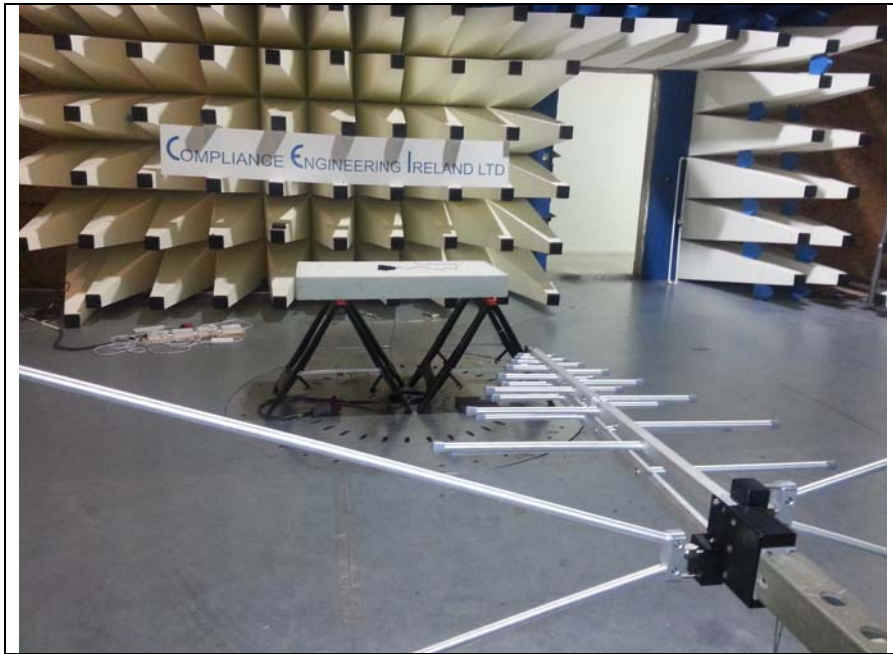
Fig 1 Test setup 30MHz -1GHz Rad Emission