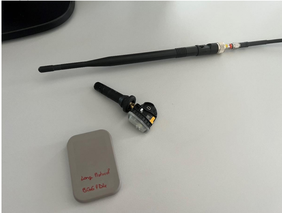
Photograph 8: Overall view.