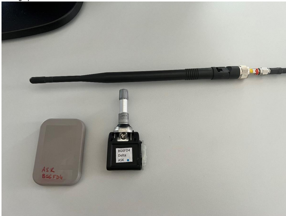
Photograph 9: Overall view.