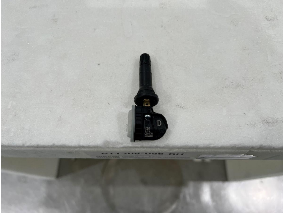
Photograph 5: Close view 2.