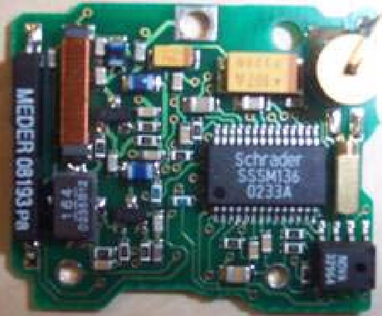
PCB top (unpotted)