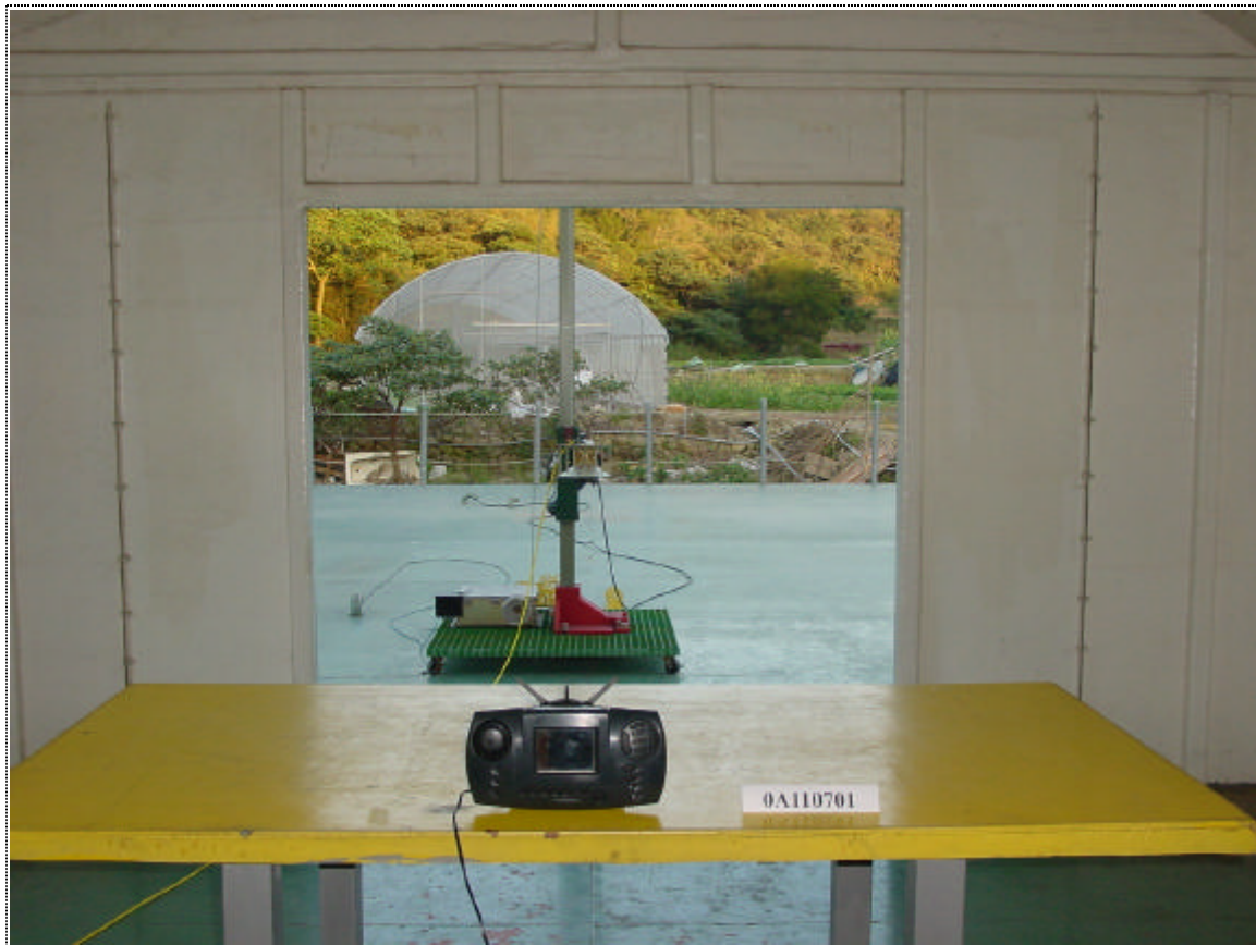
Front View (Remote Controller, 1000MHz above)