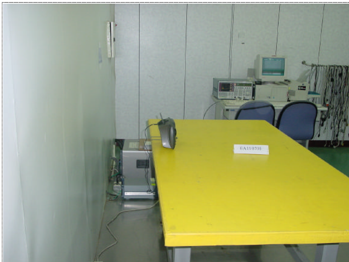
Rear View (Remote Controller)