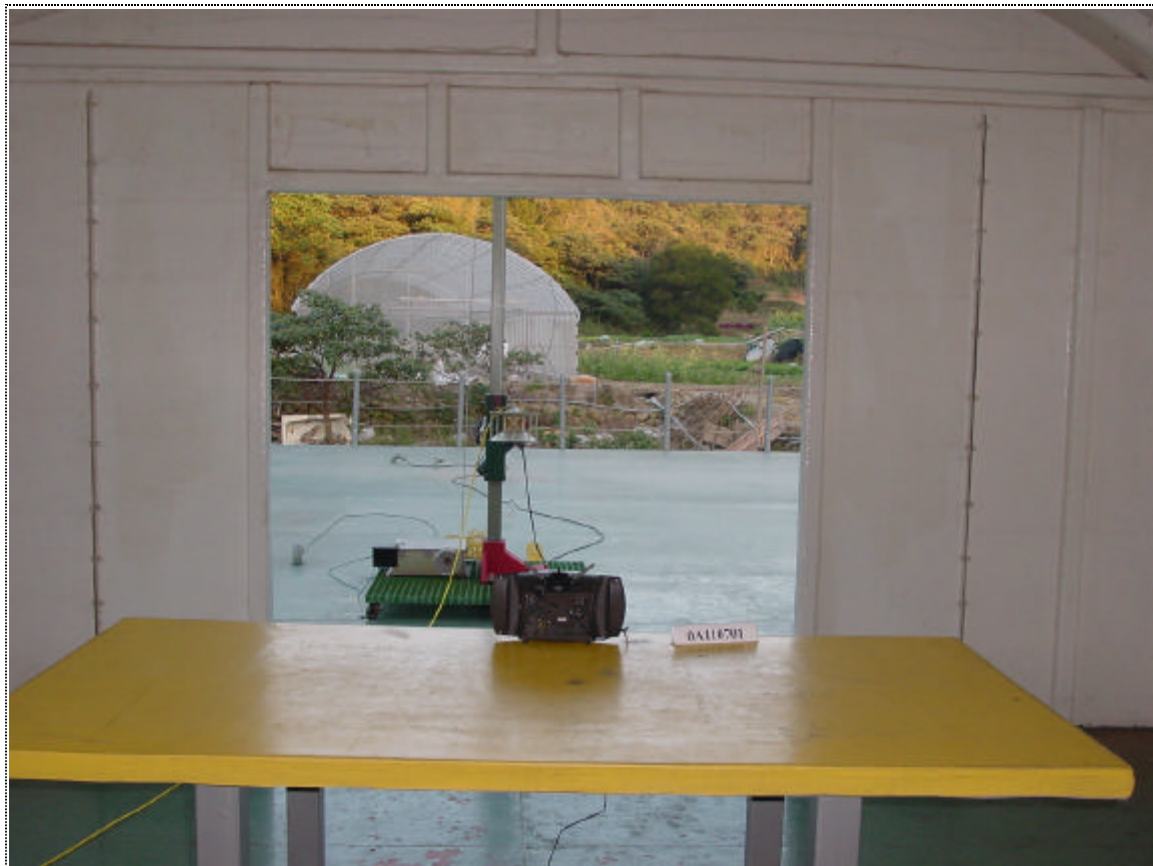
Rear View (Remote Controller, 1000MHz above)