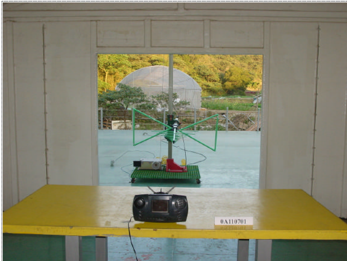
Front View (Remote Controller, 30~1000MHz)