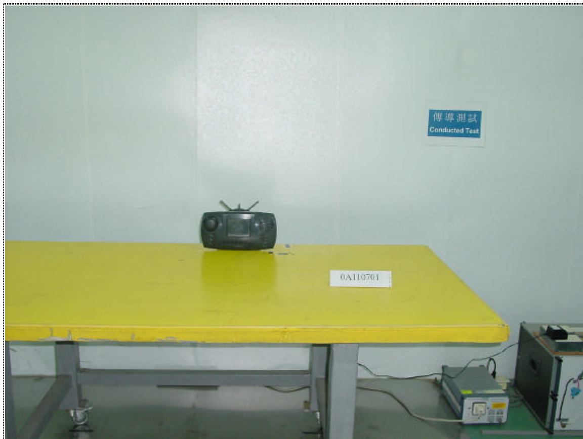
Front View (Remote Controller)