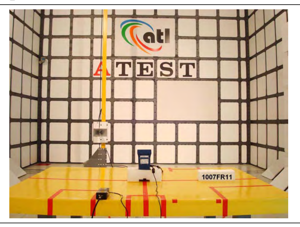
Above 1GHz _ Rear View