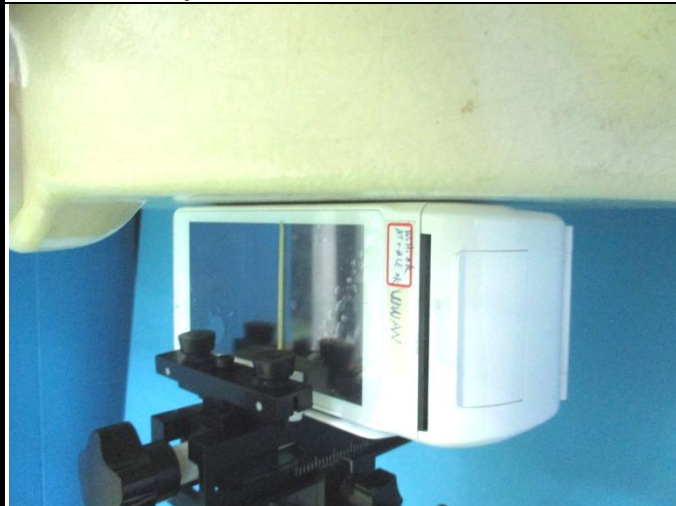
Body - Left Side of EUT at 0 mm