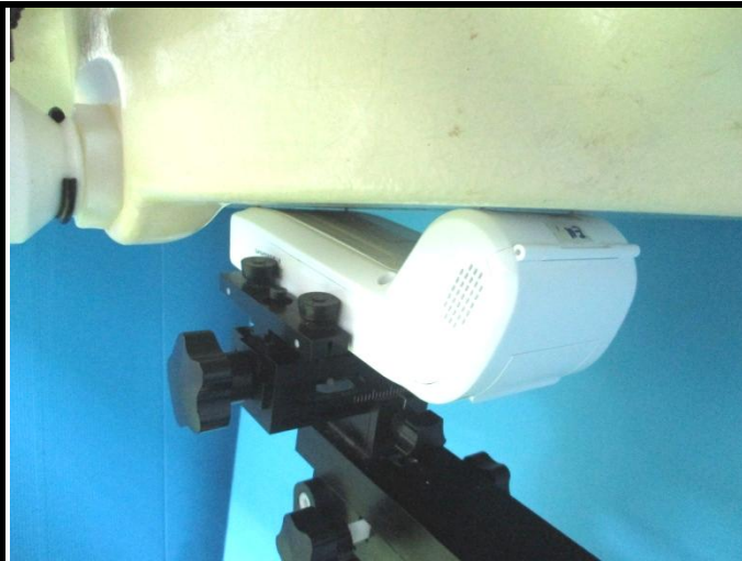
Body - Rear Face of EUT at 0 mm