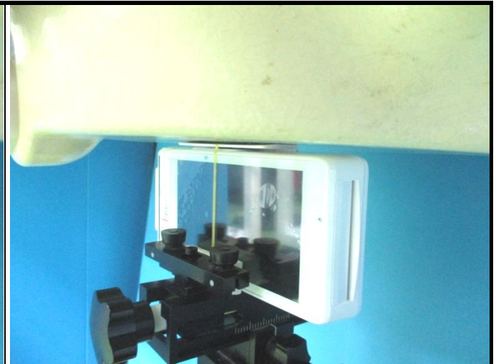
Body - Right Side of EUT at 0 mm