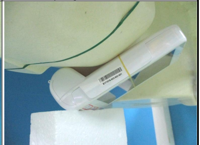
Body - Rear Face of EUT at 0 mm with Neck