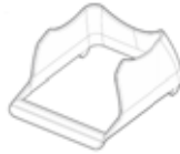
■ Privacy Shield