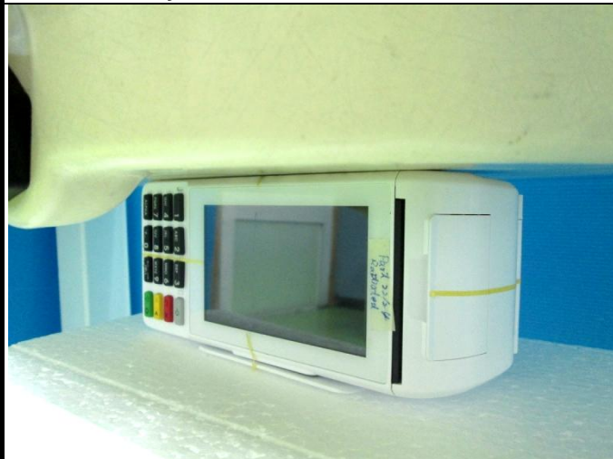
Body - Left Side of EUT at 0 mm