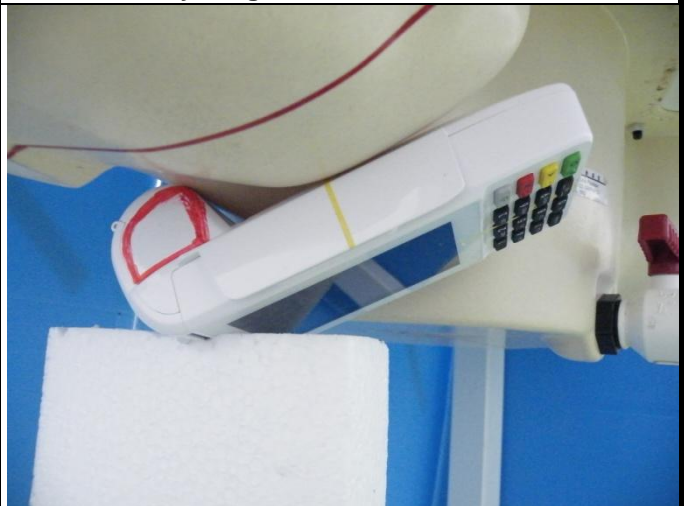
Body - Rear Face of EUT at 0 mm with Neck