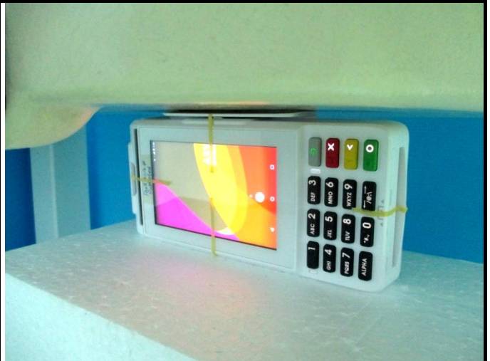
Body - Right Side of EUT at 0 mm