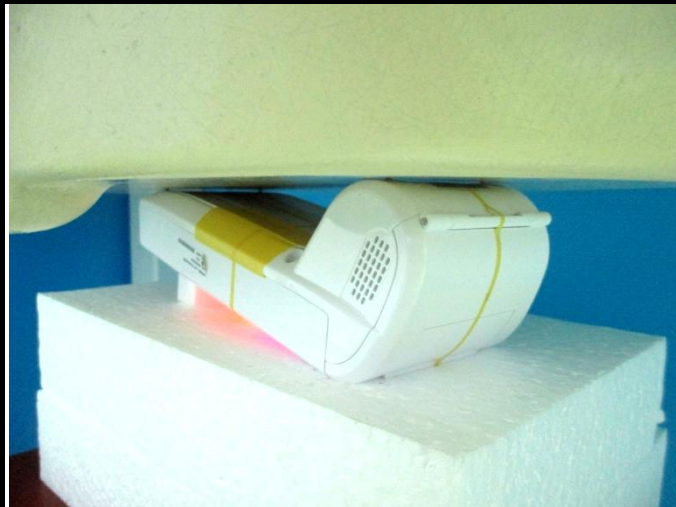
Body - Rear Face of EUT at 0 mm