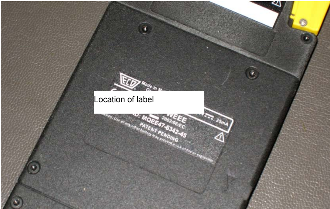
MOLE FCC label