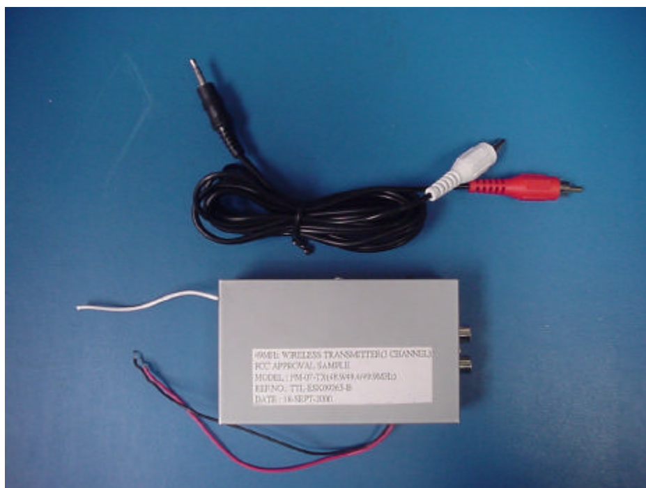
FIGURE 3: Top Of Transmitter