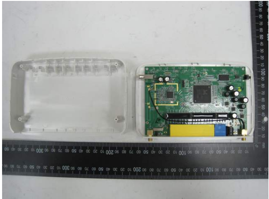
EUT with Dipole Antenna