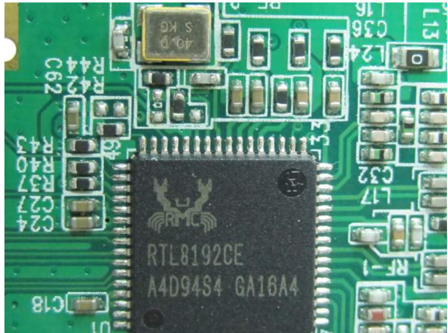
EUT with PIFA Antenna