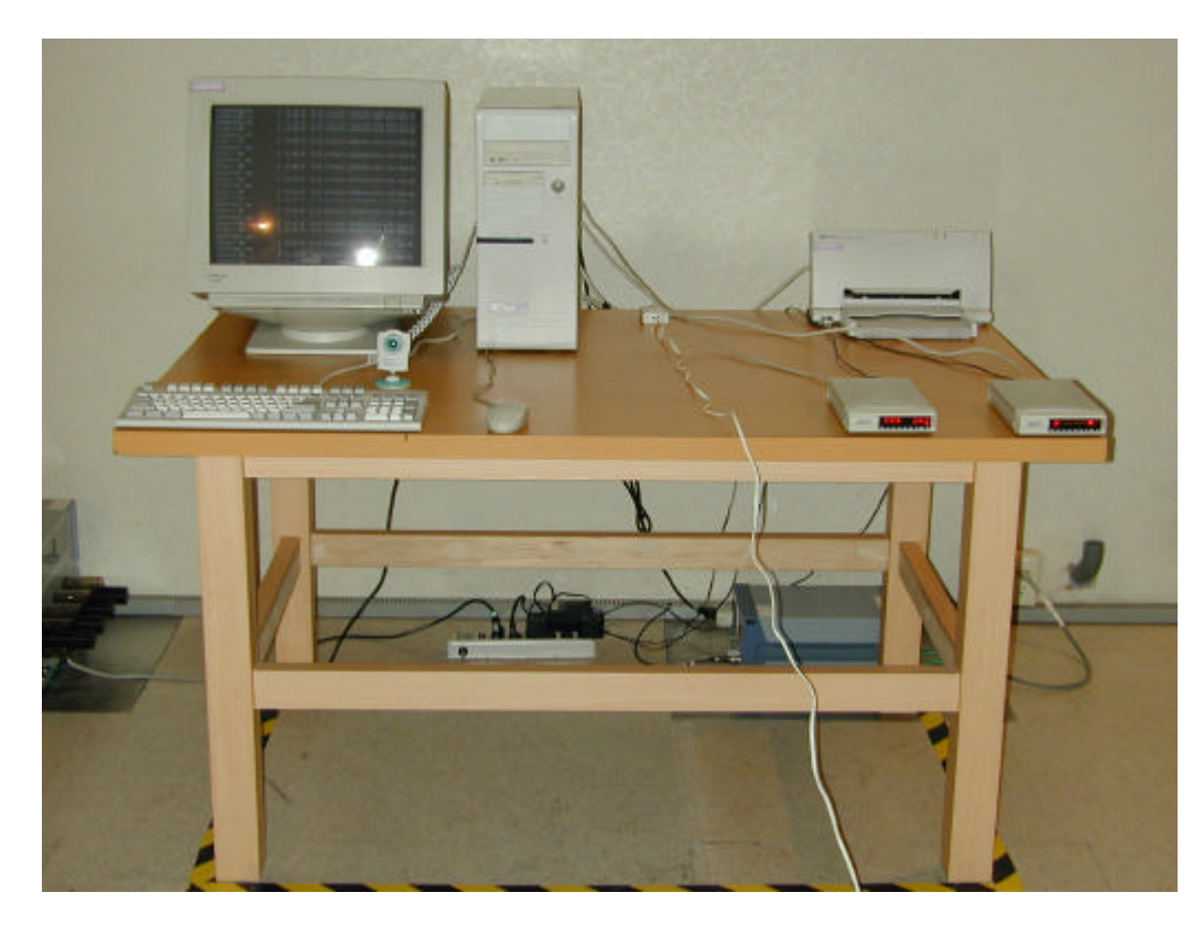
Back View of Conducted Test (Mode 1)