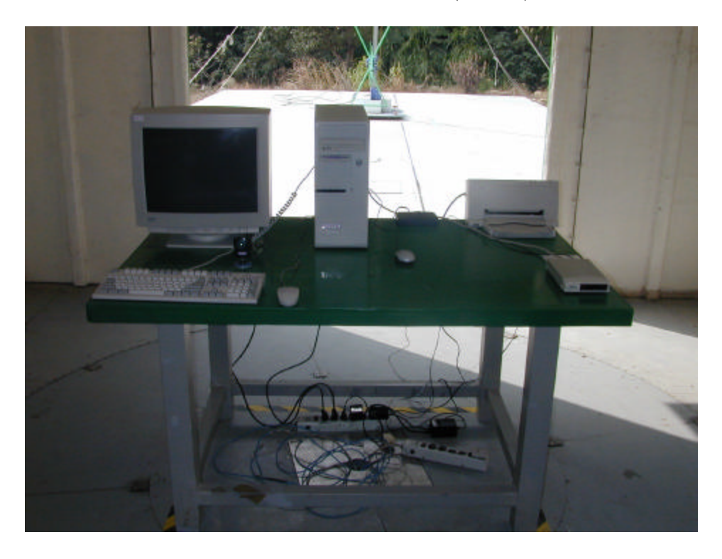
Back View of Radiated Test (Mode 1)