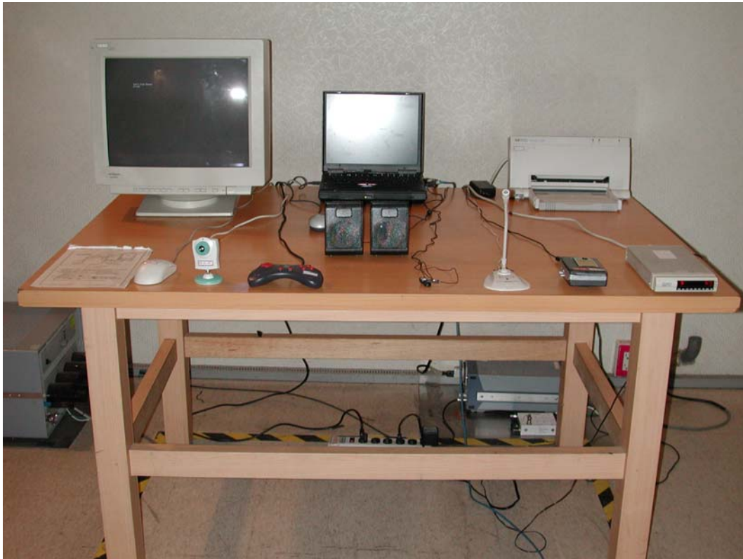
Back View of Conducted Test (Mode 2)