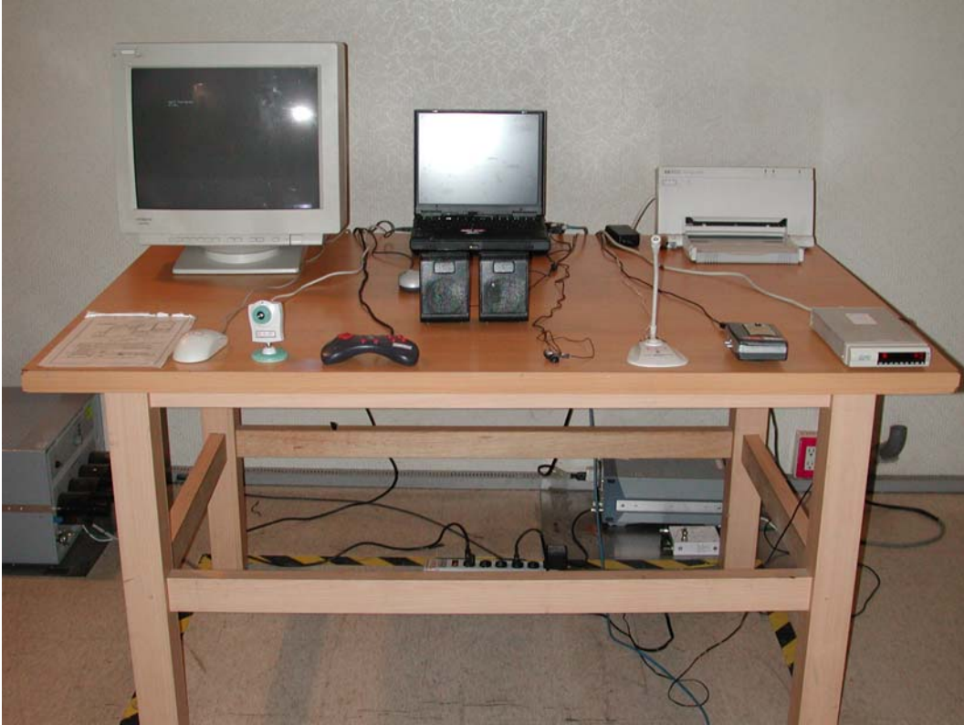
Back View of Conducted Test (Mode 1)