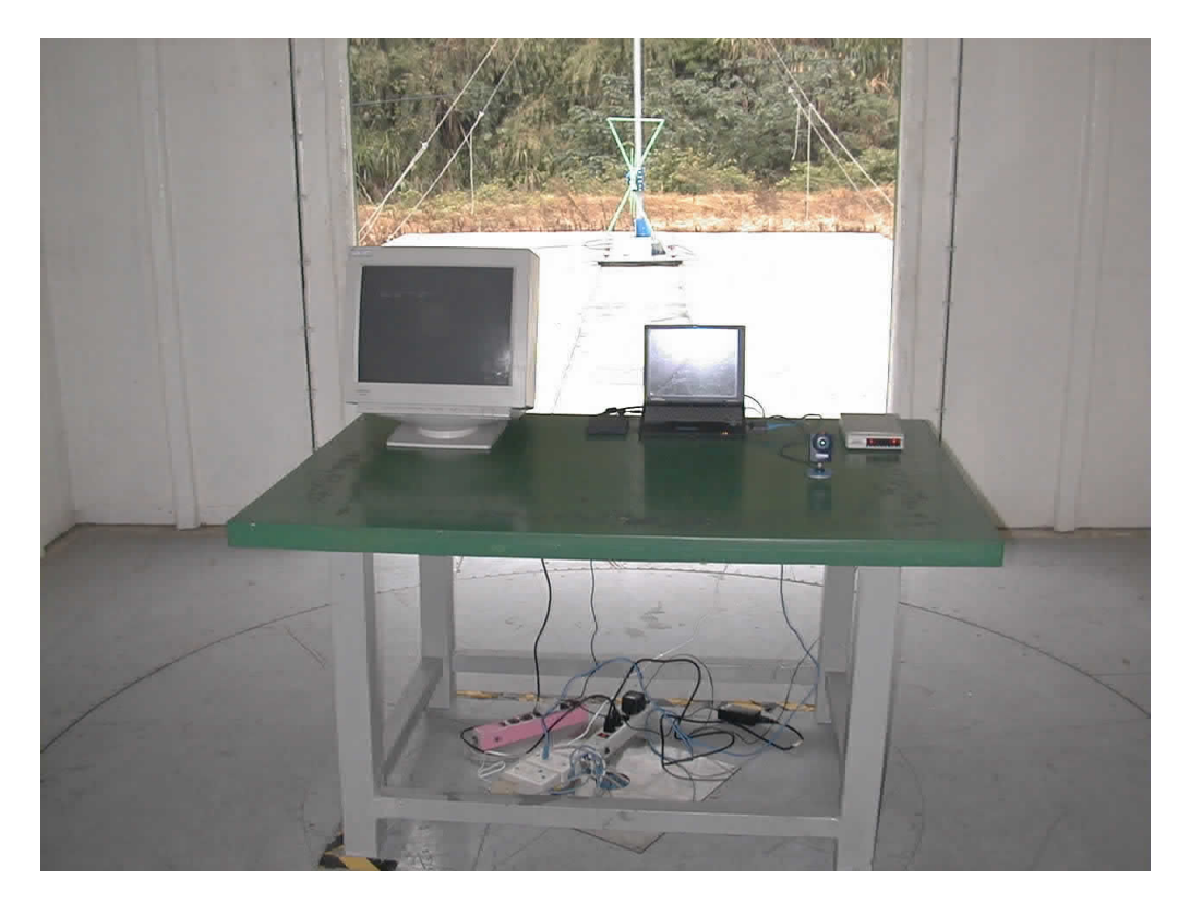
Back View of Radiated Test (Mode 2)