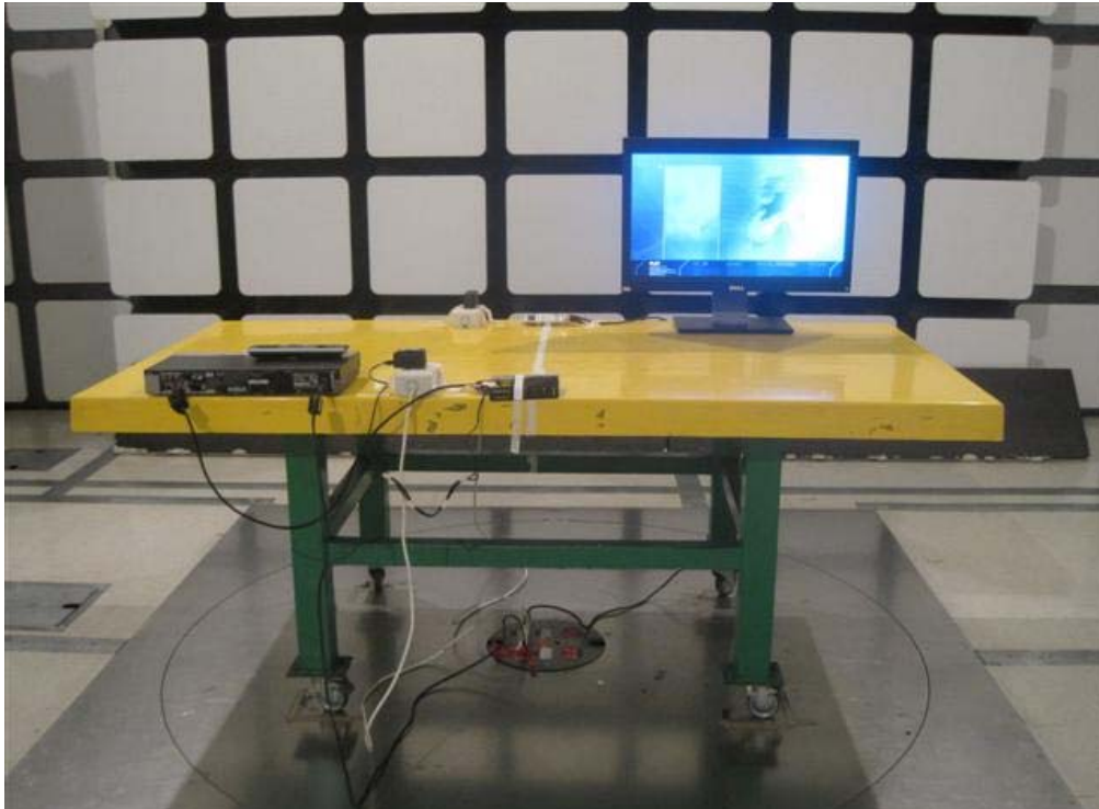
Radiated Emissions from 30 MHz to 1GHz