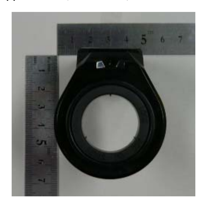
Appearance (Reverse View)