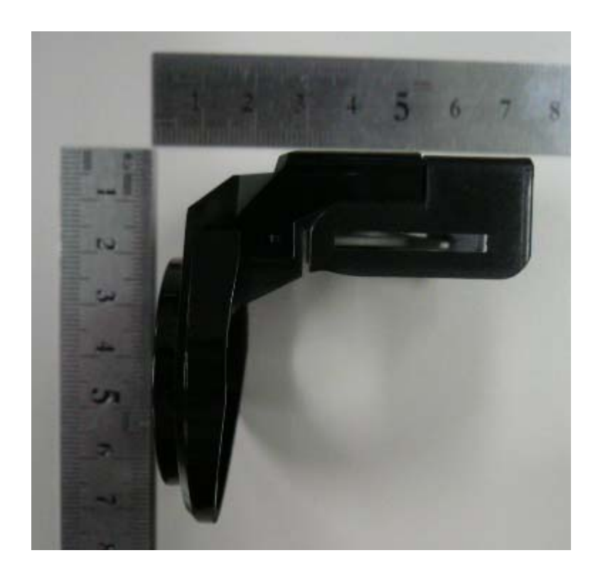
Appearance (Side View)