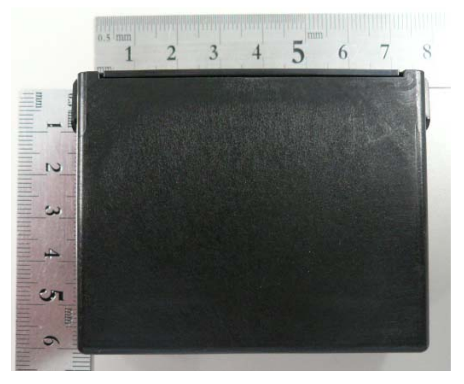
Appearance (Bottom View)