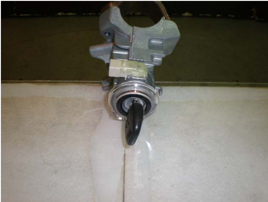
With Key (Inserted) Worst