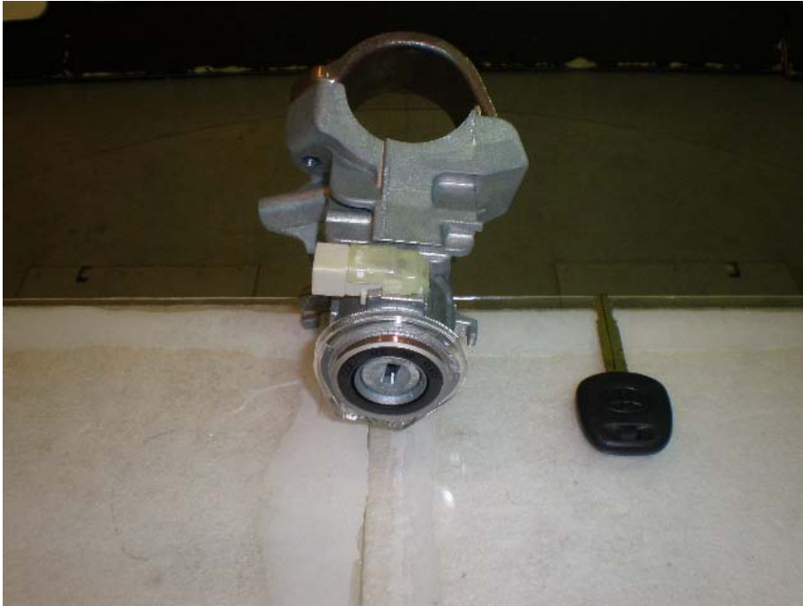
Without Key (Not Inserted)