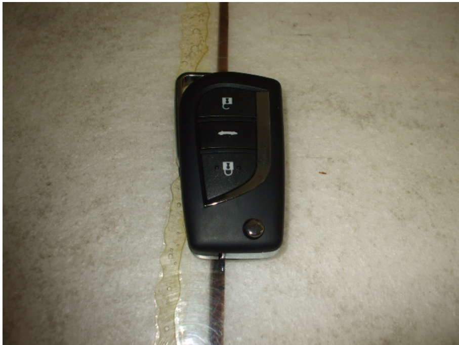
Mechanical Key (folded in)