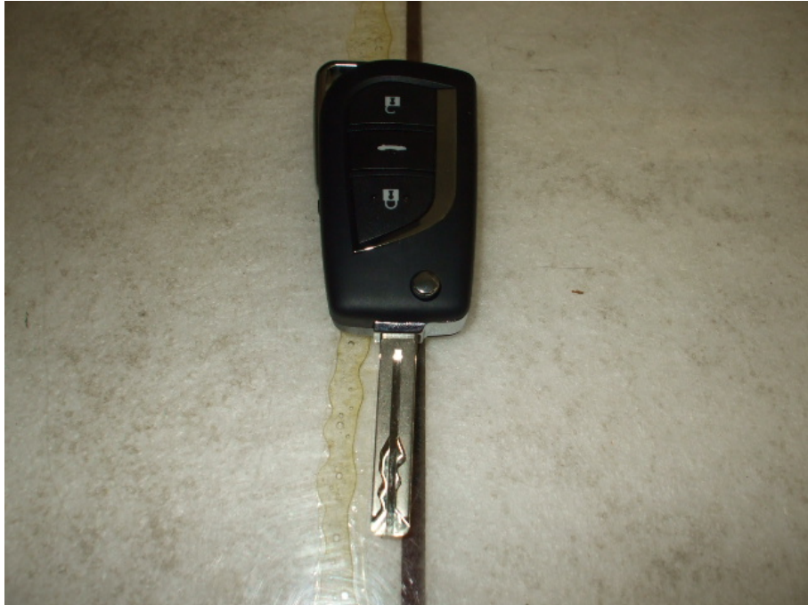
Mechanical Key (folded out) Worst