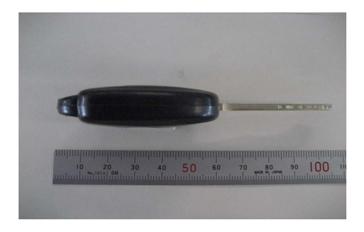
Appearance (Side View)