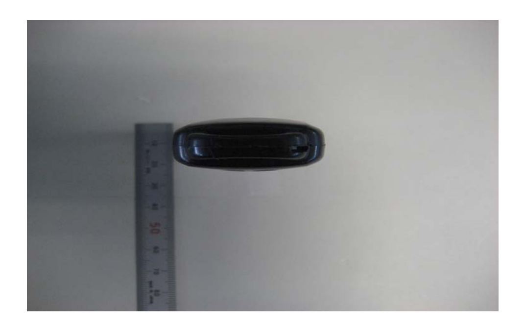
Appearance (Bottom View)