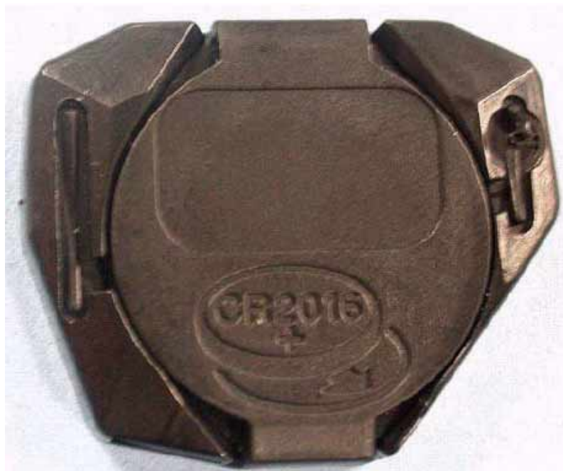
RKE Transmitter MDL B41TG Module Unite (Reverse)