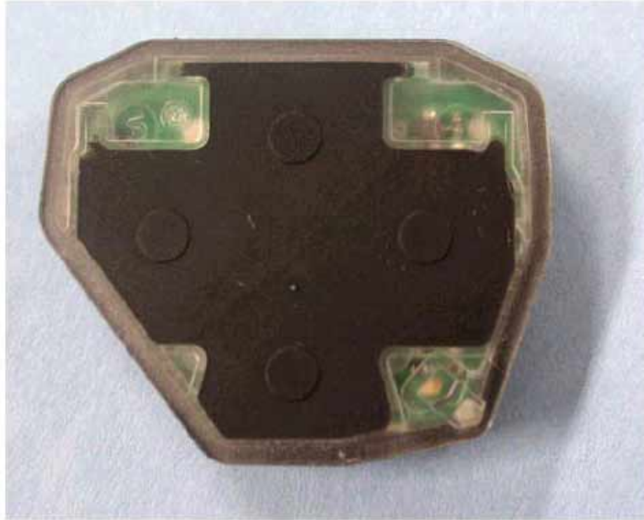
RKE Transmitter MDL B41TG Module Unite (Front)