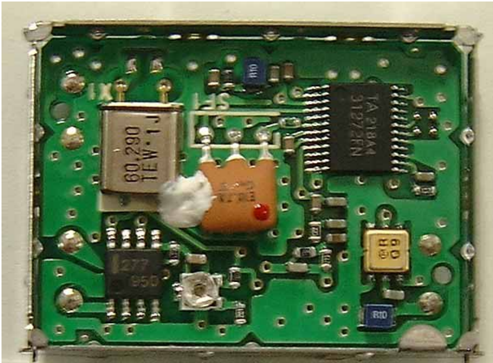
Tuner MDL B31UG RF Module (Front face)