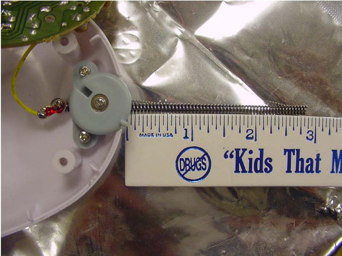
Antenna and its connection with cover removed.