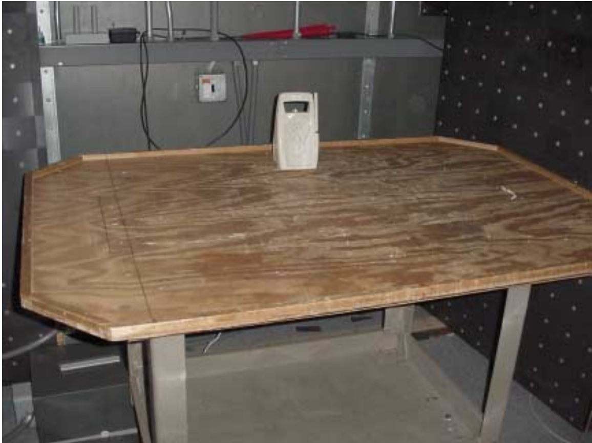
Conducted Test Setup Front