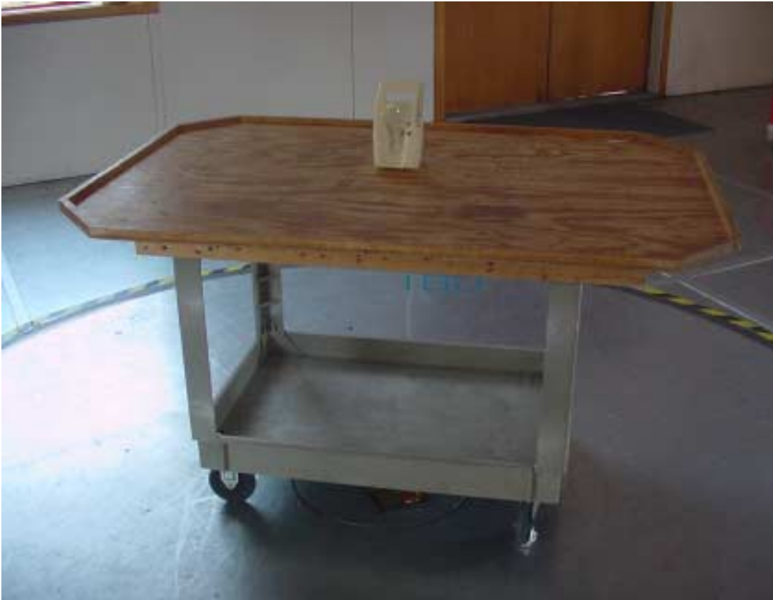
Radiated Test Setup Front