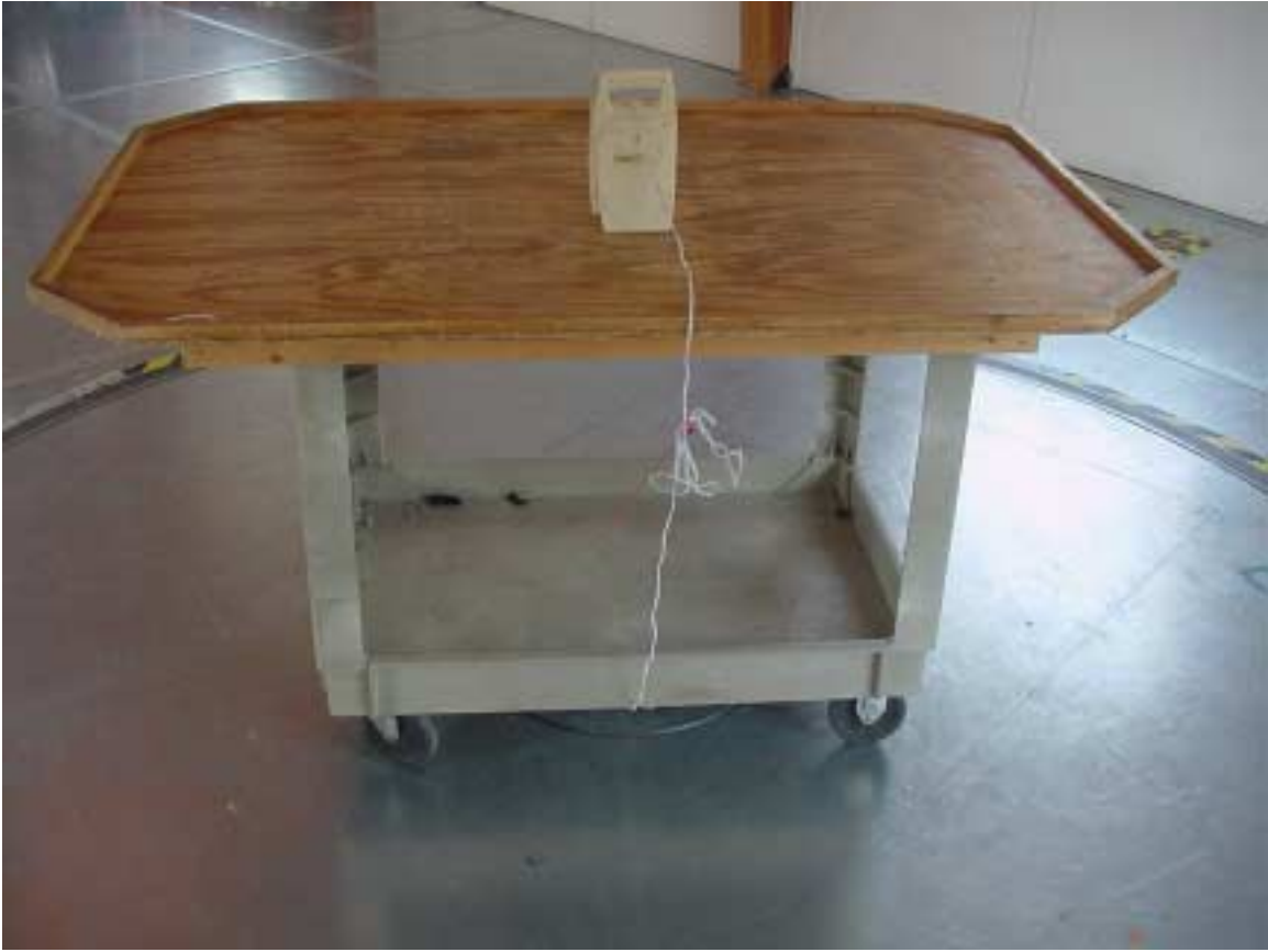
Rear of Radiated Setup