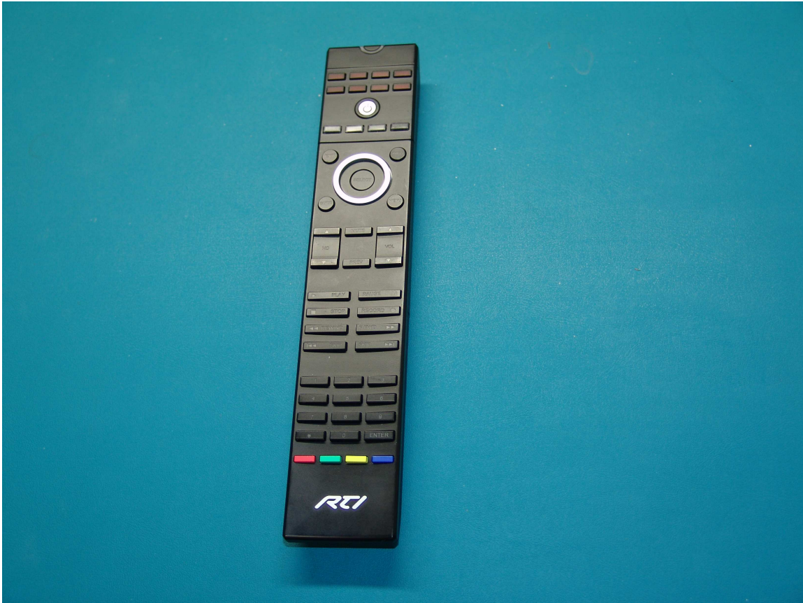
T1-B Unit - Front