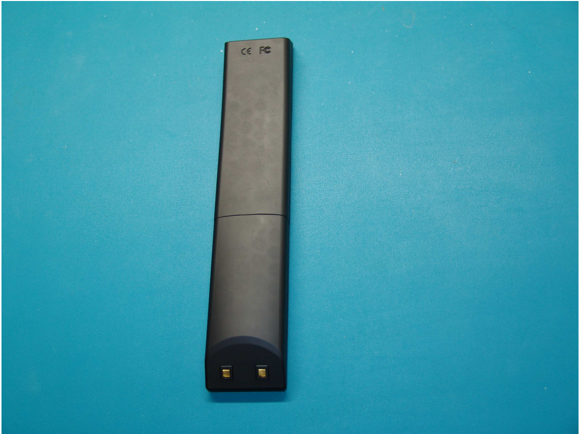
T1-B Unit - Back