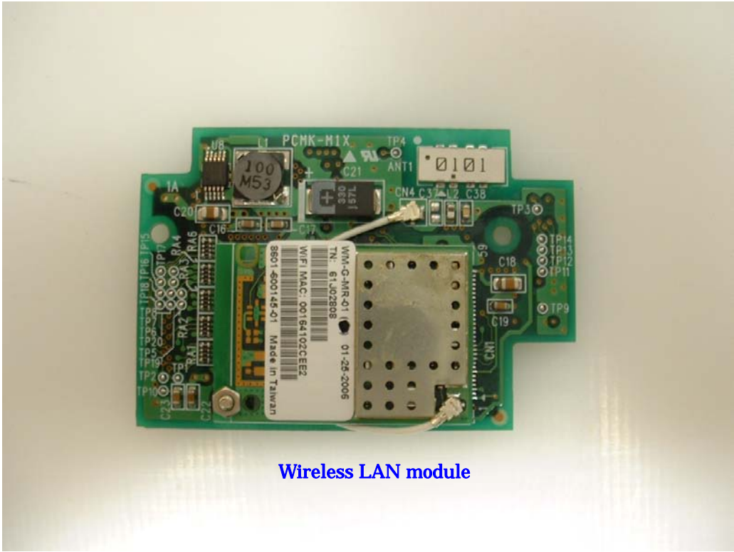
Wireless LAN module