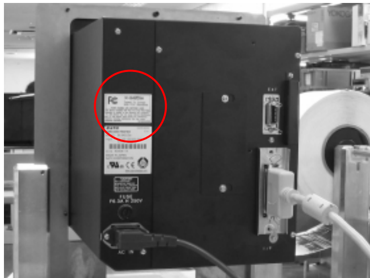
Label Position (Printer Back View)

Adhesive: Hot melt pressure sensitive adhesives, or Synthetic resin emulsion