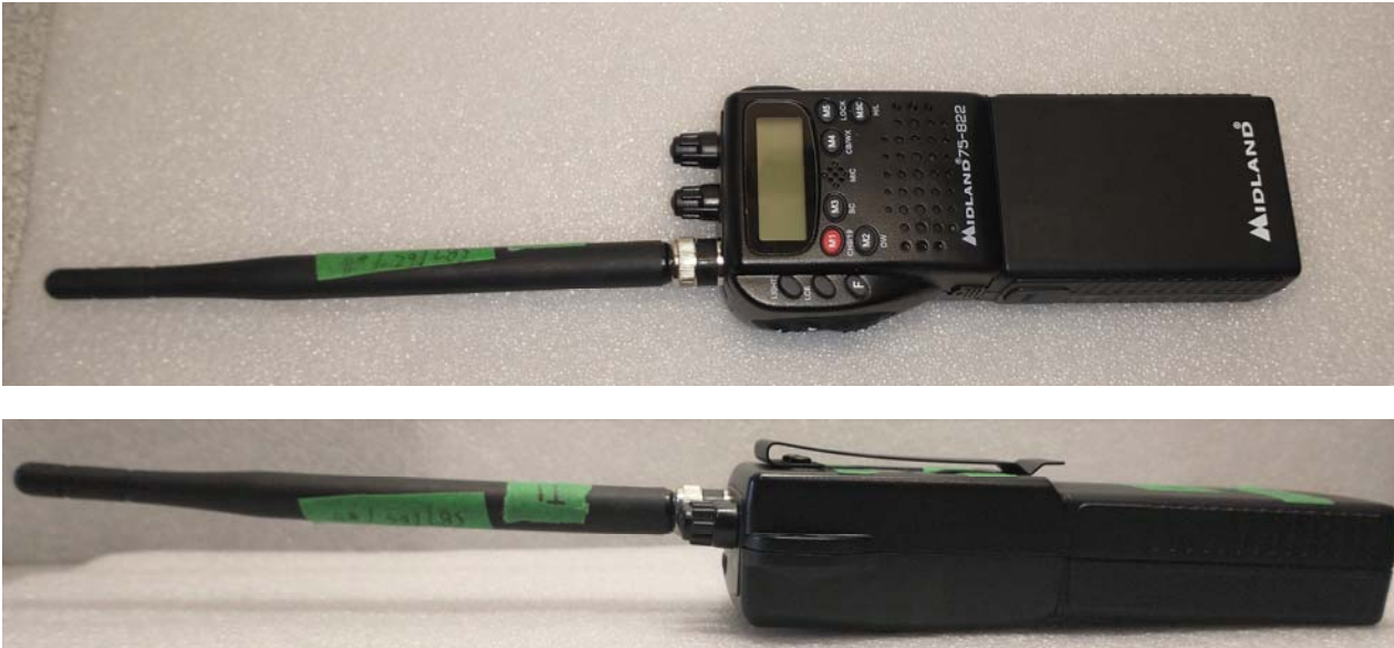
Figure D.2 Photo – 75-822, T1, P1, B1, A1 - FRONT