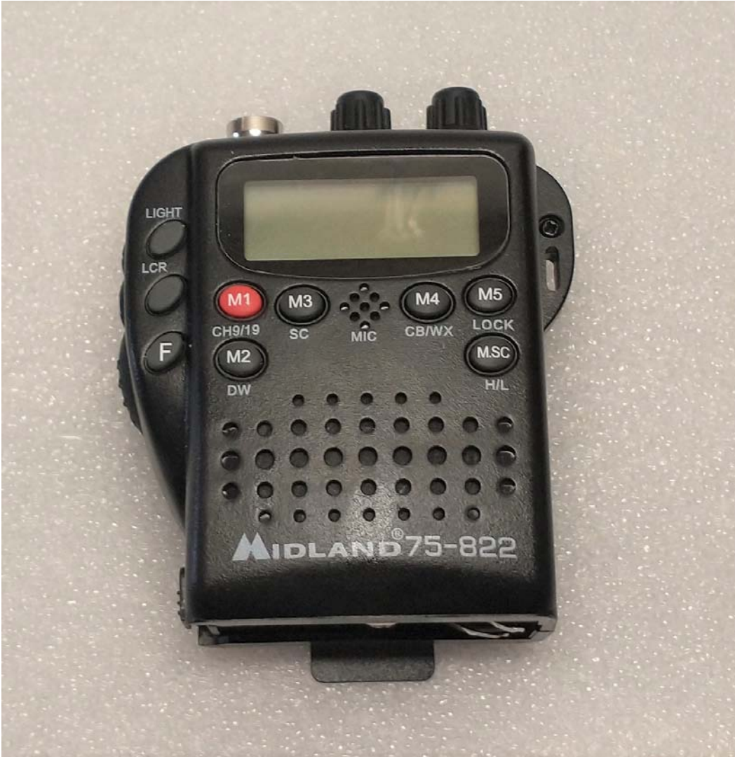
Figure D.1 Photo – 75-822 – FRONT, BOTTOM, TOP, SIDE