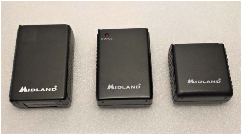
Figure D.4 Photo – P2 Open ( rechargeable USB – AA batteries x8)