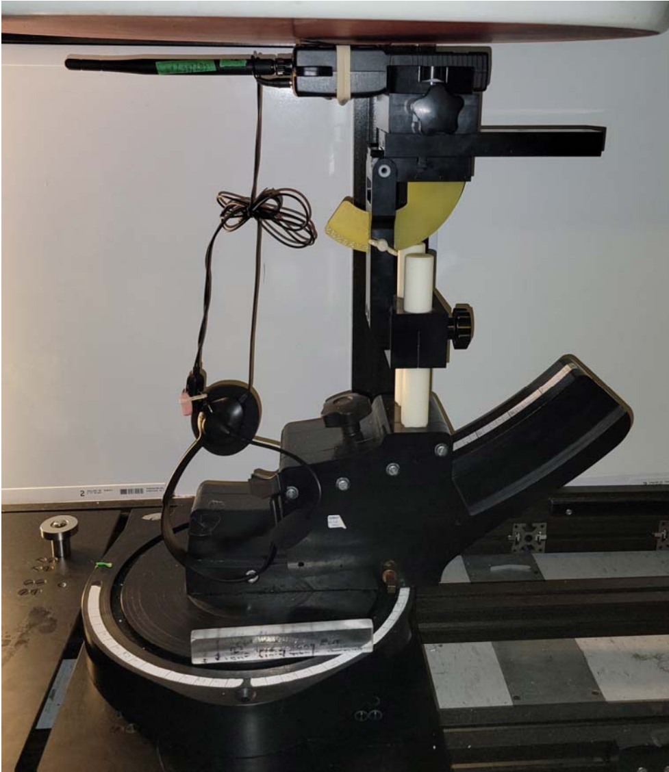
Figure C.2 Photo – Setup : Body Configuration - Close