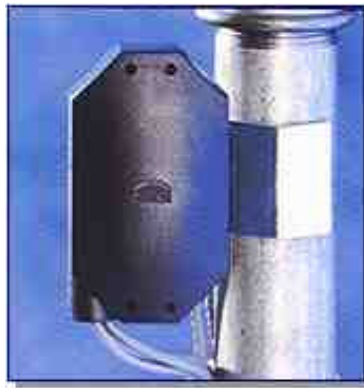
Figure 4-1: Miltel Transmitter - Pipeline Installation