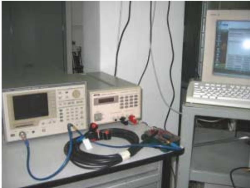
Photograph No.1 Peak output power, occupied bandwidth measurement setup