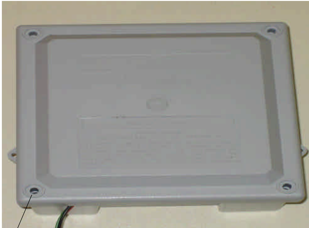
Mounting Holes x 4 place