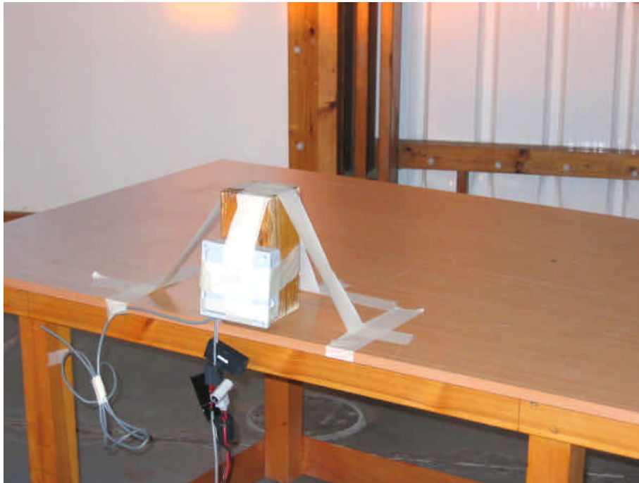
Photograph No.1 Effective radiated power, occupied bandwidth , emission mask, radiated emissions measurement setup at OATS