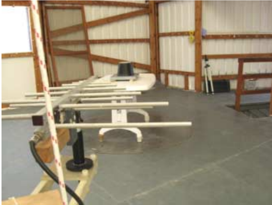
Photograph No.1 Effective radiated power, spurious emissions measurement setup at OATS