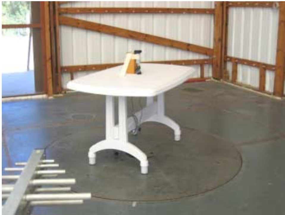
Photograph No.1 Effective radiated power, occupied bandwidth, radiated emissions measurement setup at OATS