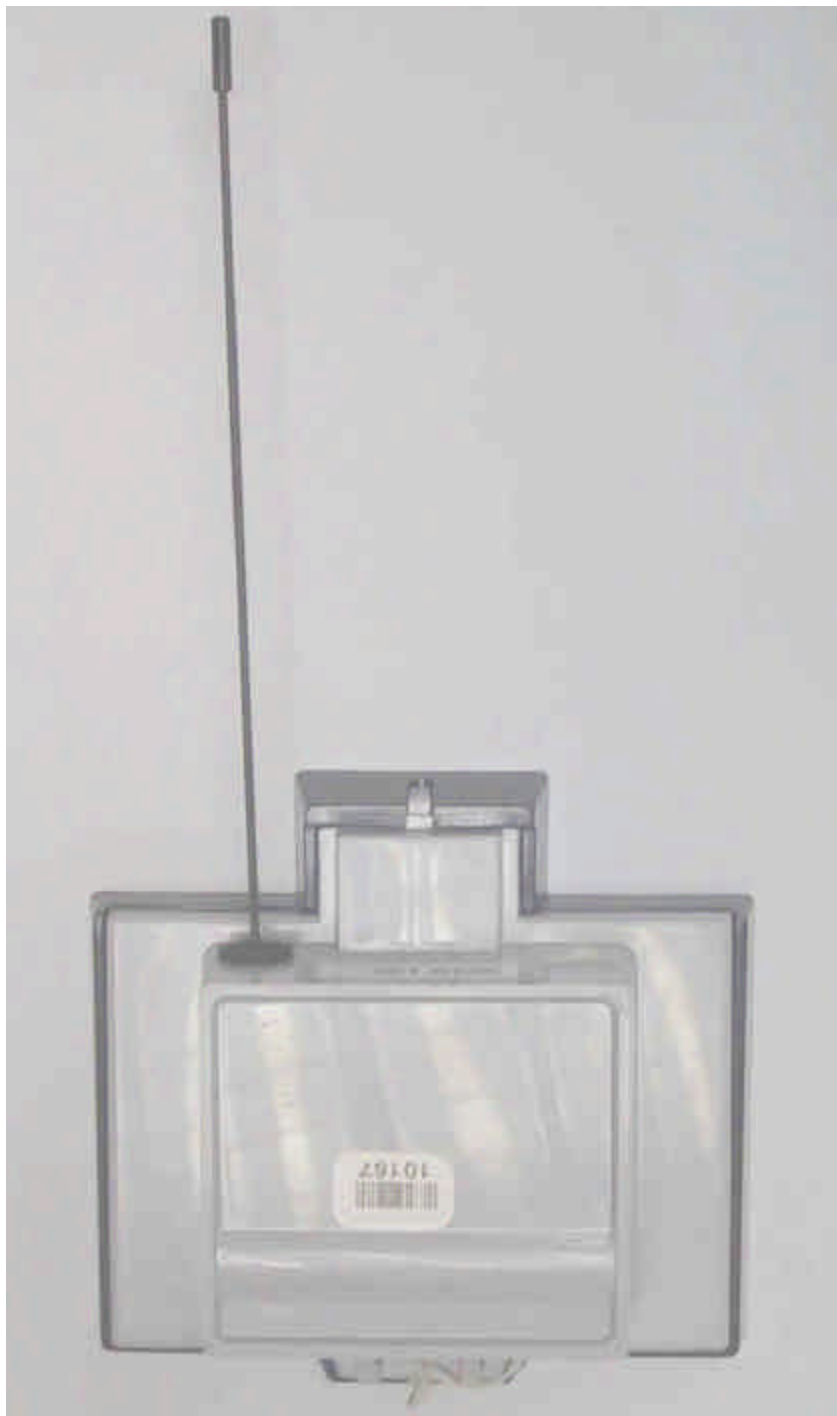
Photograph No.1 Galaxy Remote transmitter Front view