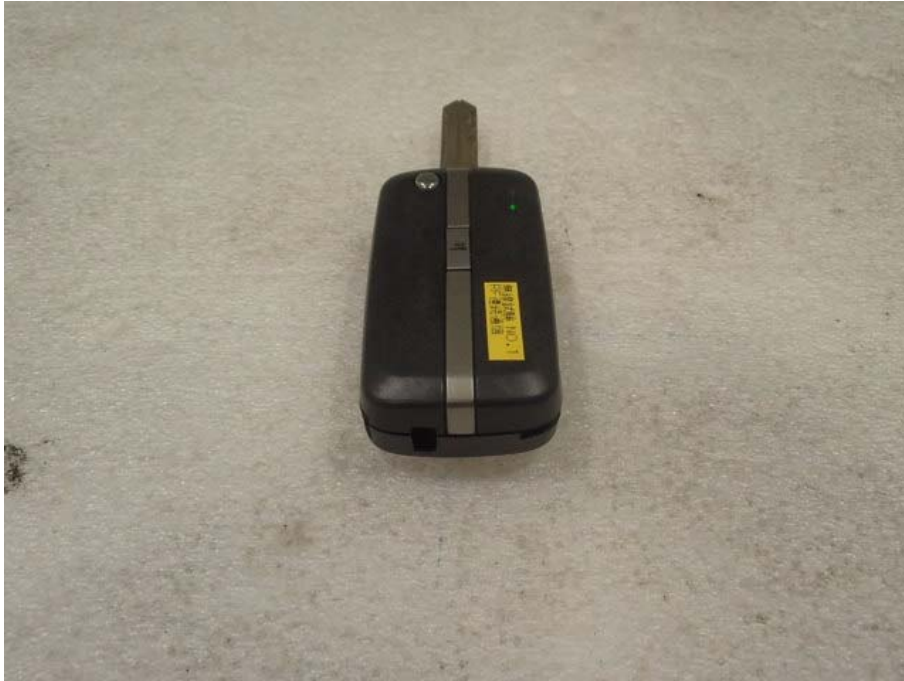
Mechanical Key (folded out)