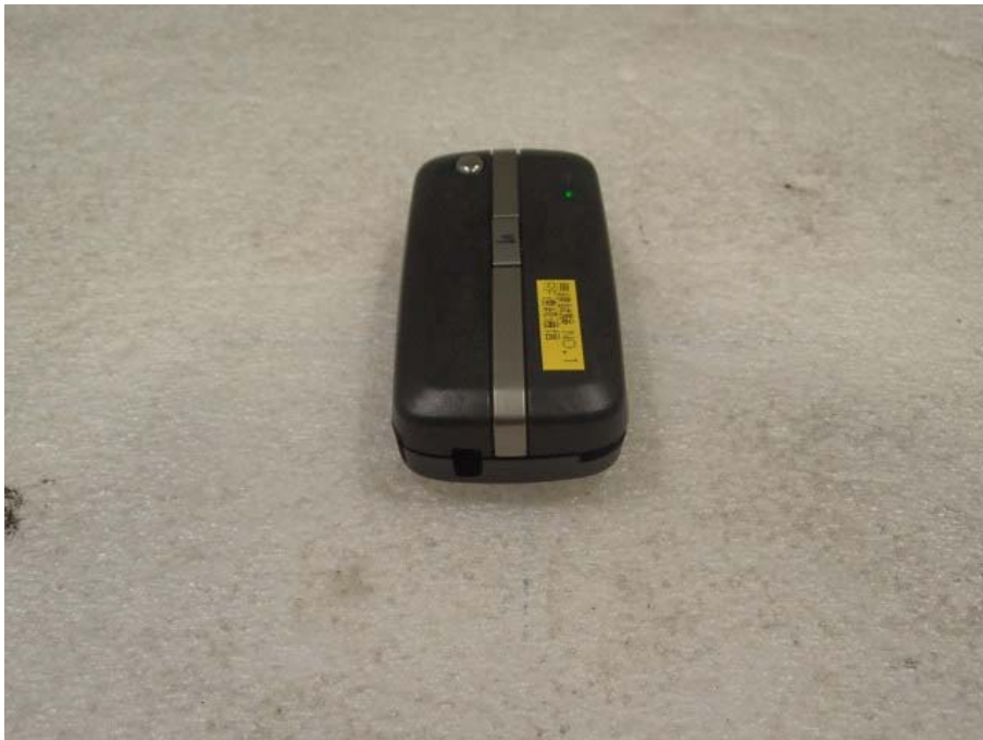
Mechanical Key (folded in) Worst