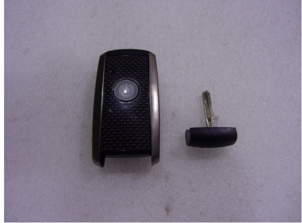
Mechanical Key (Not Inserted)