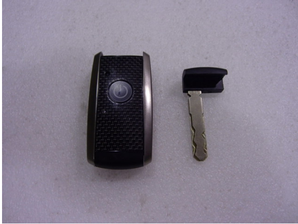
Mechanical Key (Not Inserted)