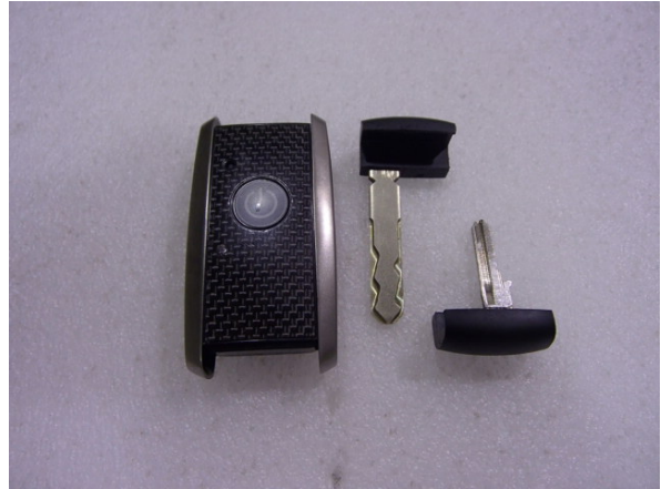
Mechanical Key (Not Inserted) Worst Below 1GHz