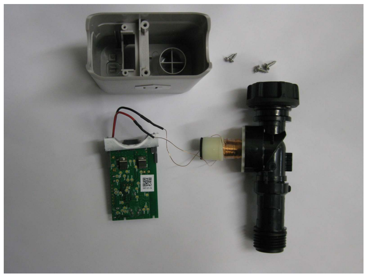
Figure 4 - Parts disassembled - bottom of pcb.