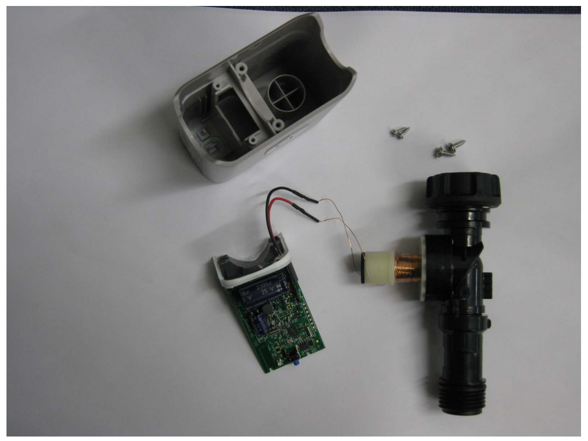
Figure 3 - Parts disassembled - top of pcb