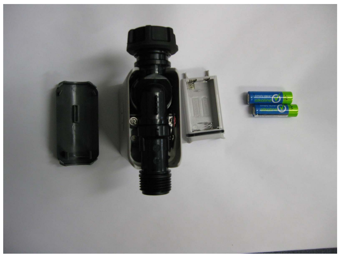
Figure 1 - Access cover removed and battery compartment removed.