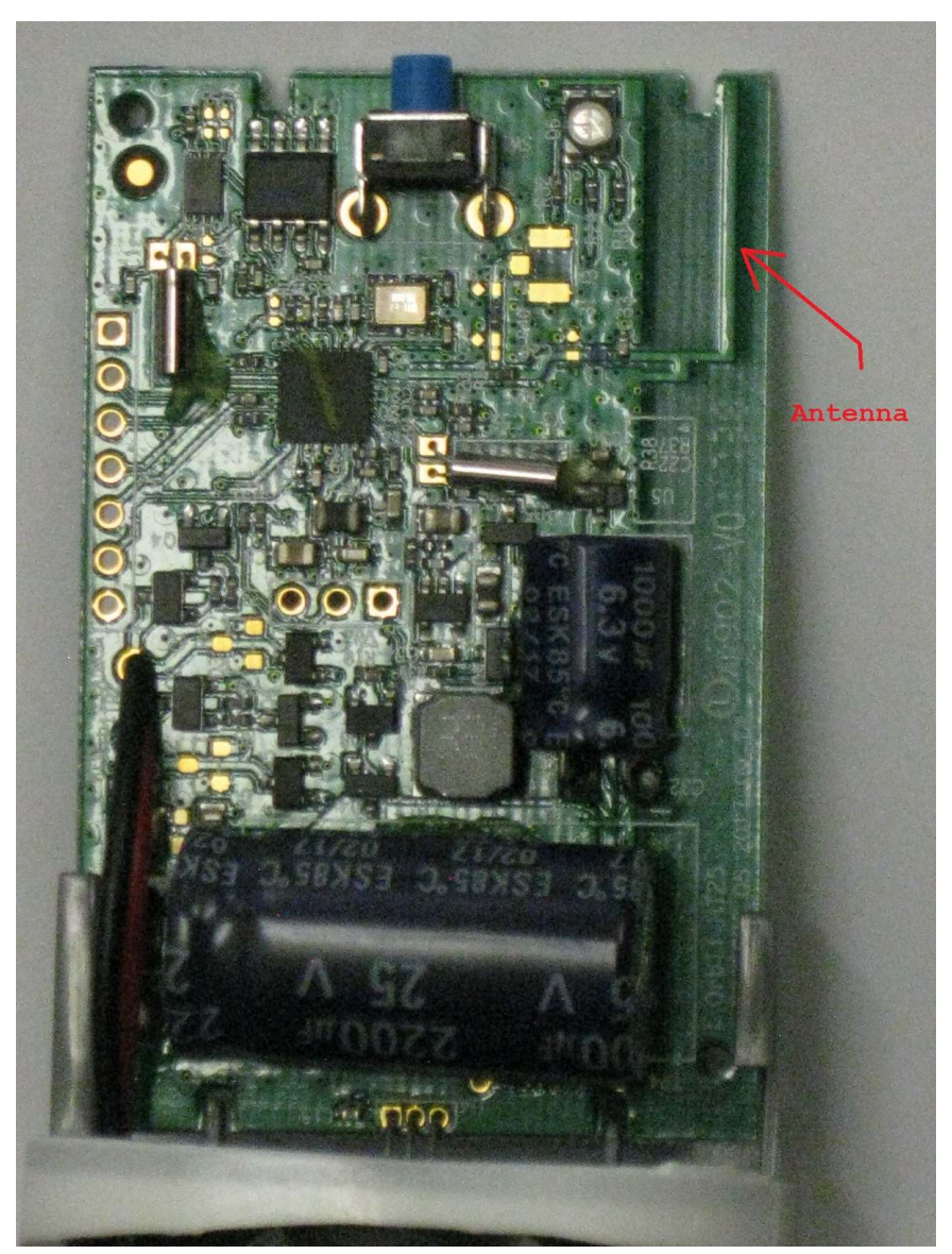
Figure 7 - Top of pcb with antenna location.