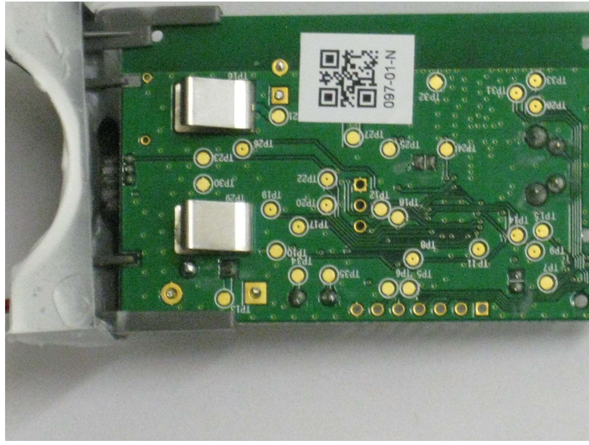
Figure 5 - Bottom of pcb