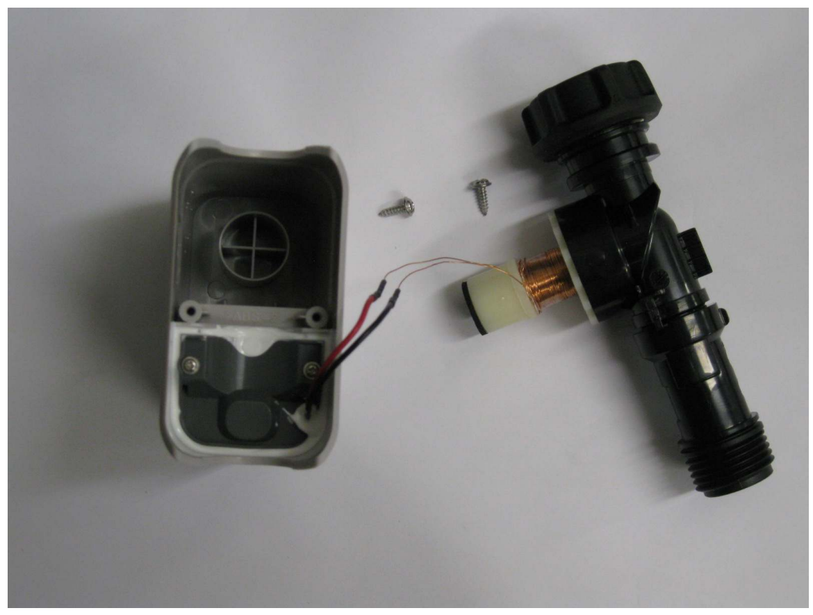
Figure 2 - Solenoid removed